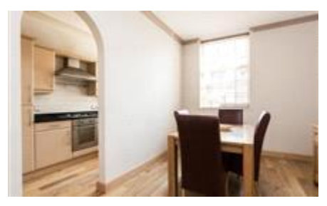
***Unique Two Bedroom Apartment*** Dower House Development, Escrick*** Offered Unfurnished*** Parking*** Two Bathrooms*** Own Outdoor Garden/Yard*** Available October 2023***