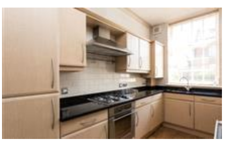
Flat , Dower House, Dower Chase, Escrick, York £995 pcm